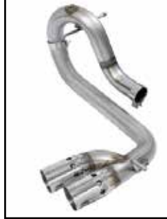
Side-Exit Exhaust System

P/N: 49-44065-B (Blk Tip) 49-44065-P (Pol Tip)