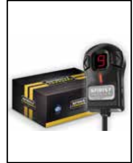
Sprint Booster V3

P/N: 46-70302 (Black) 46-70302-WL (w/ Oil) Turbo Downpipe