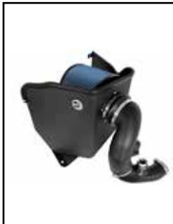
Cold Air Intake System