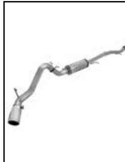
DP-Back Exhaust System

P/N: 49-44073-B (Blk Tip) 49-44073-P (Pol Tip)