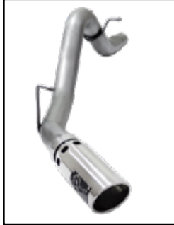
DPF-Back Exhaust System

P/N: 49-44064-B (Blk Tip) 49-44064-P (Pol Tip)