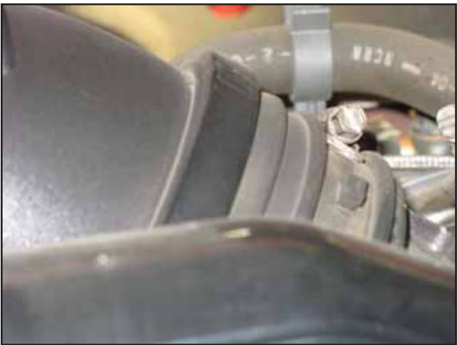
c. Lift up on the intake resonator to pop it off the mount and gain access to the hose clamp on the inlet tube. Loosen the hose clamps on both ends of the inlet tube.