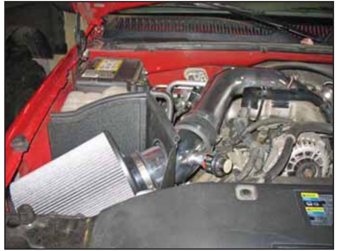
AEM® intake system installed