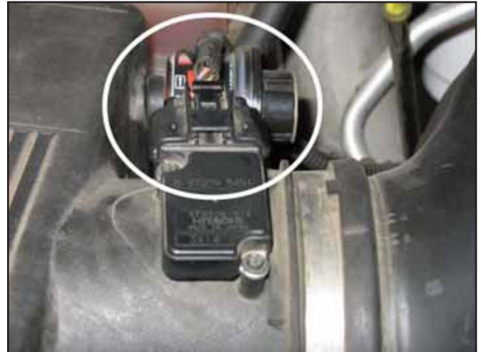
b. Unplug the mass air flow sensor (MAF) wiring harness.