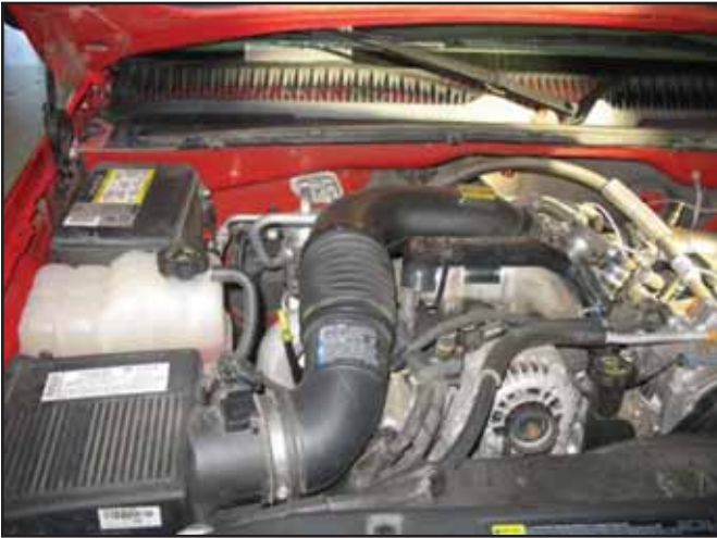
a. Factory air box system installed.