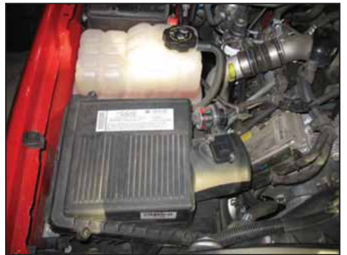
d. Remove the inlet tube and resonator from the engine bay.