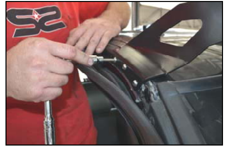
12. Adjust light bar to be level and torque down all bolts.