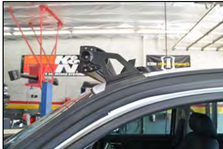
14. Place rubber seal back onto drip rail. This will seal bracket and wiring from the elements.