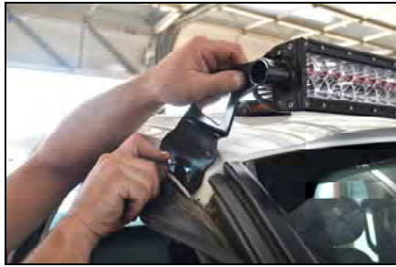
11. Drop passenger side down and align with holes. Install bolts into passenger side bracket.