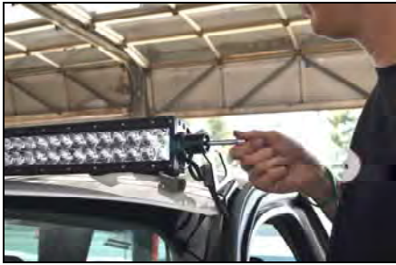
10. Fasten LED light to driver side LRM bracket.