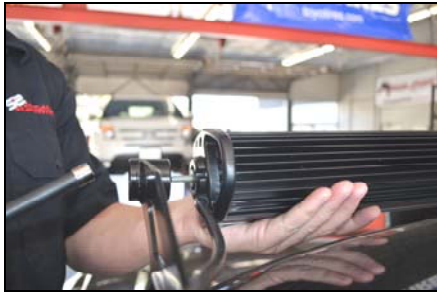
10. Fasten LED light to driver side LRM bracket.