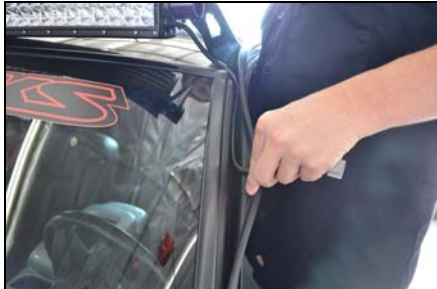
13. Route power wire down rain gutter between windshield and door seal and wire light bar as noted in light bar instructions.