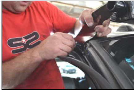
11. Drop passenger side down and align with holes. Install bolts into passenger side bracket.