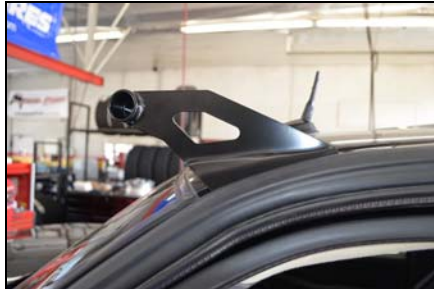
14. Place rubber seal back onto drip rail. This will seal bracket and wiring from the elements.