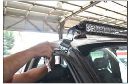
12. Adjust light bar to be level and torque down all bolts.